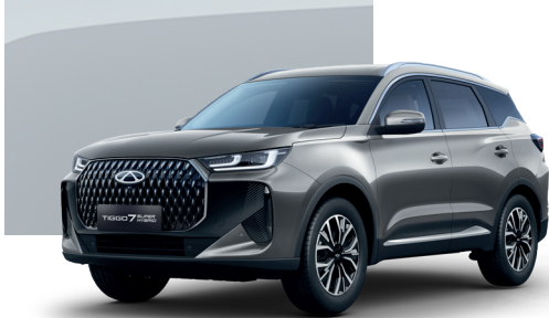
Mercurial Grey (GV)