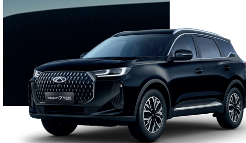
Space Black (CL)*