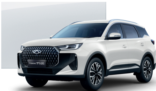
Lunar White (BW)*